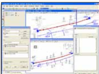
Bentley Electric includes several powerful and configurable network trace tools.