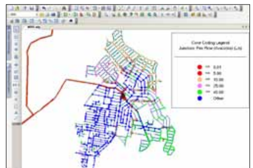
The WaterGEMS thematic mapping capabilities show the available fire flows that helped it to identify critical locations and to discover that the general capacity shortfall occurred in this zone’s northern supply area.

“We estimate that we will save about half a million dollars in planning and design overheads in the long term. In optimized capital works, we expect to save tens of millions of dollars, because we are able to run more analyses within the available timeframe leading to optimized design.”