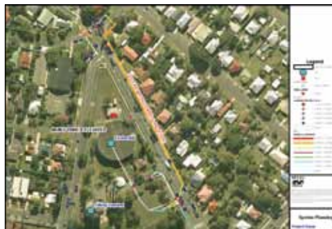
The WaterGEMS integration with ArcGIS allows users to analyze their network directly inside ArcGIS and to overlay model results in ArcGIS for presentation.

In addition, WaterGEMS model results can be read directly inside ESRI’s ArcGIS, one of the four platforms (stand-alone, AutoCAD, and MicroStation®) WaterGEMS supports out of the box. The ArcGIS integration allows a network model and its results to be overlaid on rich background maps and layouts, eliminating the need to import or export model results.