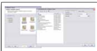
SewerCAD provides a broad range of tools for estimating and allocating sewer loadings.