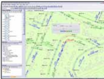
SewerCAD's stand-alone, MicroStation, and AutoCAD platforms offer platform freedom and versatility.

SewerCAD Scenario Management Center gives engineers full control to configure, run, evaluate, visualize, and compare an unlimited number of what-if scenarios within a single file. Engineers can easily make decisions by comparing unlimited scenarios, analyzing rehabilitation alternatives for multiple planning horizons, evaluating pump operation strategies, or overflow scenarios with varying future wastewater flows.