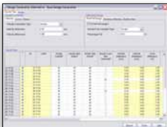
Automatically determine diameters and invert elevations with SewerCAD's constraint-based design.