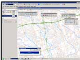
Data extracted from the Oracle database may be edited in the feature-rich environment of Bentley Map.