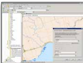
The connection can be filtered spatially or by using attribute criteria.