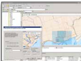
Connect to Oracle Locator or Oracle Spatial using simple-to-use dialog, supported by live or disconnected connections.

The ProjectWise Connector for Oracle enables seamless information integration between Bentley engineering and mapping applications and Oracle's 10G and later databases. It allows live and disconnected, long and short transactional editing of organization defined Oracle Spatial data.