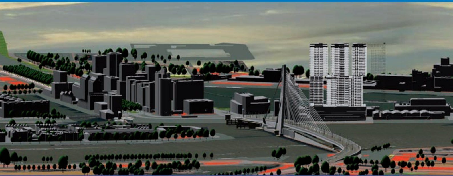
3D Model of Rotterdam