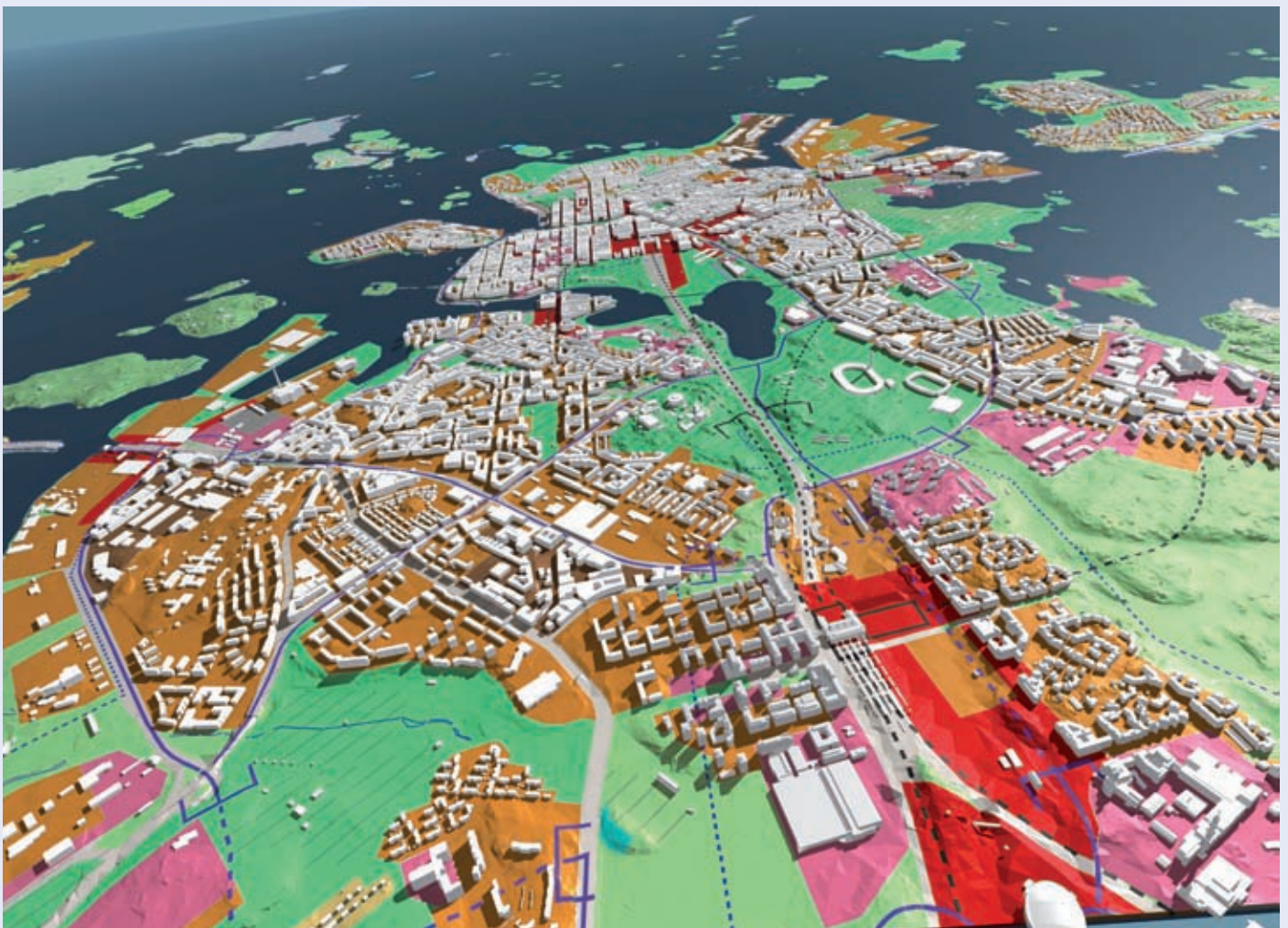
3D Model of Helsinki

Project Wise Geospatial Server fully leverages Oracle Spatial 11g's 3D and raster support. It also provides and manages the BIM/GIS integration that so many organizations have been looking for, for the past decade. Geo Web Publisher allows mash up streaming of your models to Google Earth and Google Earth browser plug-in, providing seamless integration of your 3D City models into Google. 3D reality needs 3D design, engineering and analyses. If you are integrating and updating an existing infrastructure, and this is quite