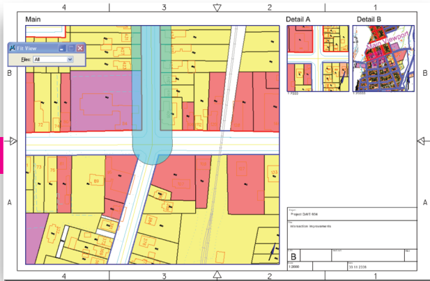
Print preparation screen capture