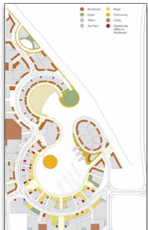
Water Garden City master plan schematic

The gravity sewer network proposed for the project included three intermediate sewage lifting stations. Minimum depth of manholes was assumed to be 1 meter, with the maximum depth of manhole limited to 5.5 meters to avoid dewatering problems during the installation of the sewer network and potential inflow of saline water during operation. Permissible velocities derived from the network modeling ranged from 0.6 meters per second (m/s) to 3 m/s.