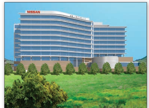
The Nissan Americas Corporate Facility, an 11-story, 550,000-square-foot office building in Franklin, Tennessee opened four months ahead of schedule with a cost savings of $1.2 million.

GS&P used its RAM Structural System model to communicate with its structural steel detailer, who used the information to generate an advanced bill of materials (ABM). The ABM was used in conjunction with GS&P's hardcopy drawings to secure bids from steel fabricators. On an $8 million