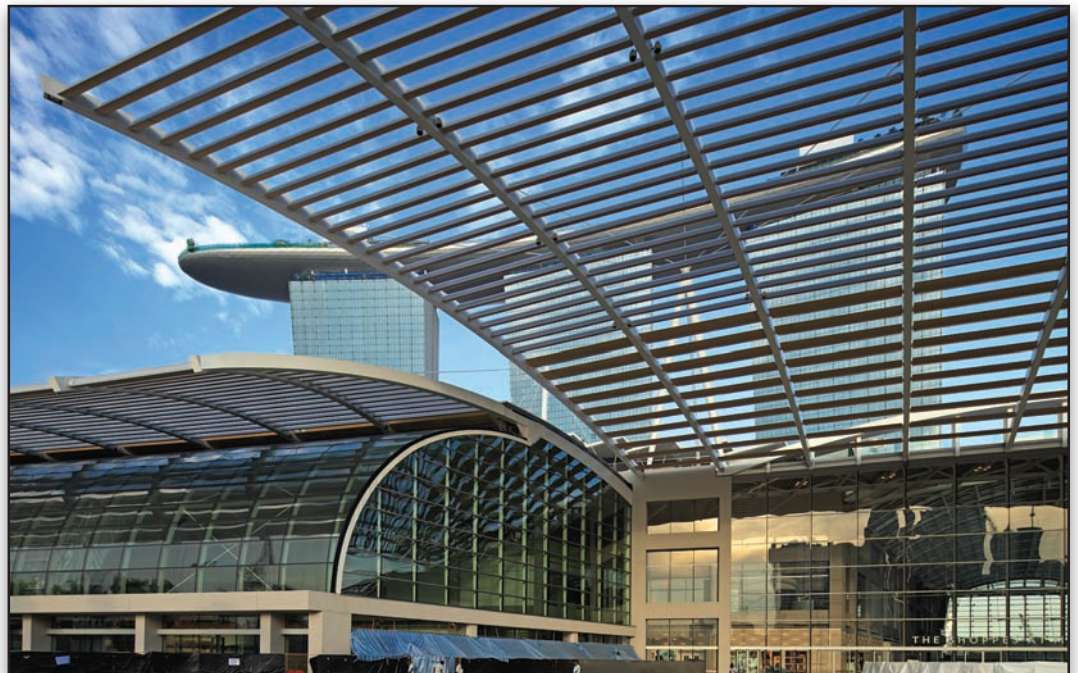
Marina Bay Sands Resort completed façade.

Pynn continued, "From the outset of the project in June 2006 through to its opening in June 2010, the success of the Marina Bay Sands project has been responsible for a 500 percent increase in the size of our building modeling team in the Singapore office. To illustrate this, the modeling/documentation team was just six people at the start of 2006 and at the height of the project in 2008 that team had grown to 30."