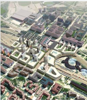
City of Helsinki 3D model

Bentley Descartes, MicroStation, ProjectWise