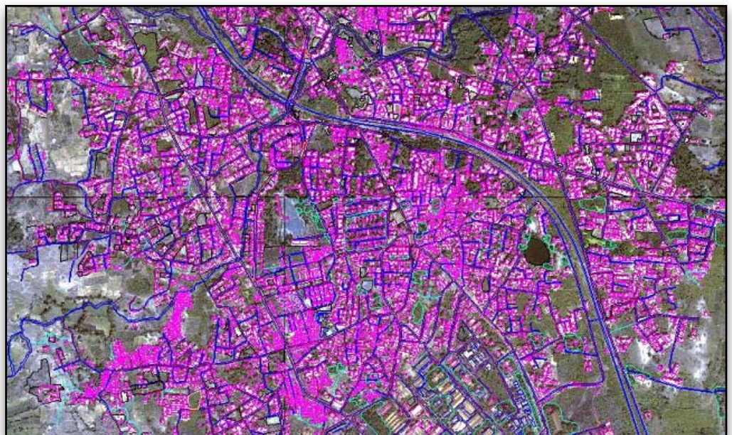
Satellite image of Badlapur

The project required management of a vast amount of data, comparison of permutations, and a combination of a large number of scenarios resulting from various alternative measures to create a comprehensive model. According to Dr. Dahasahasra, using WaterGEMS in this project