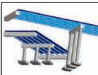
Multiple bridge project views: 3D views of multiple bridge projects assist with complex geometry visualization.