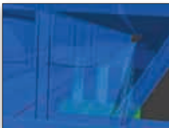
View reinforcement inside 3D model: The transparent option displays super and substructure reinforcement.