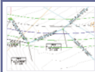
Complete final construction drawings easily using the advanced labeling functions.