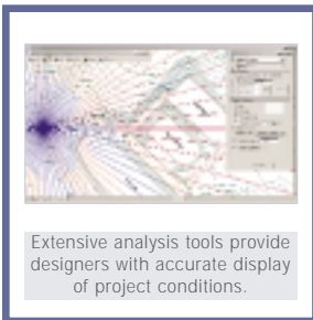
Extensive analysis tools provide designers with accurate display of project conditions.