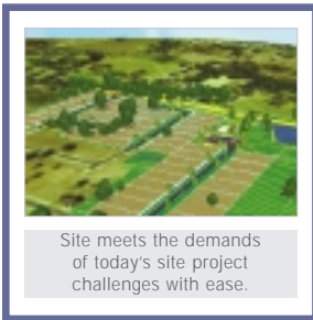
Site meets the demands of today's site project challenges with ease.

A user-friendly Composite Section dialog assists you in defining the edges of pavement from centerline outward. You can add shoulders, curbs, gutters and sidewalks, as well as create a table of offset distances and elevations to define the curb and gutter section that will run along the edge of pavement. Left and right sides can be as similar or as different as the need requires.